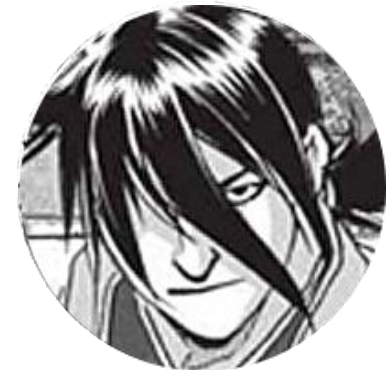
Core Disciple Jangpyeong