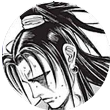
Core Disciple Song Ja-gun