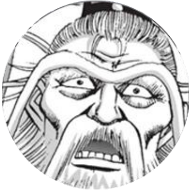
Hua Mountain Sect's Leader, Jinmu