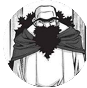
Hua Mountain Sect's Great Elder