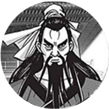
Hua Mountain Sect's Elder