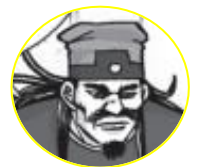
Ahn Su Trade House's butler