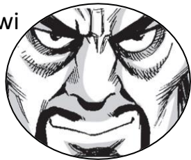
Yang Do il