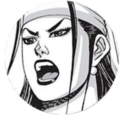
Physician Association Seo Physician