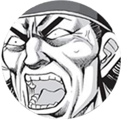
Gwihon Sect No.1