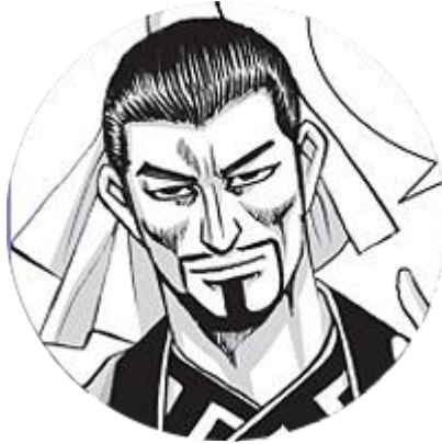
Ahn Su Trade House's Leader

She has extraordinary intelligence, but his body aches due to syllable veins