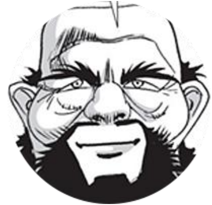
Senior Elder Yak Seon-moon