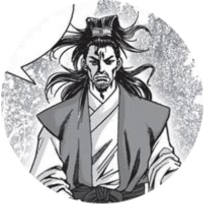
Head of Ahn Su Physicians